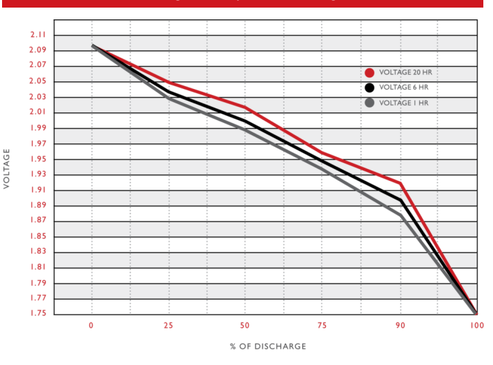
Voltage vs. Depth of Discharge